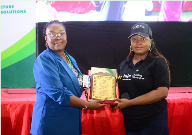
Presentation of award plaque to Lujo Height Homes QSRBN Bronze Sponsor