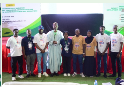
Photograph of the President with YQSF