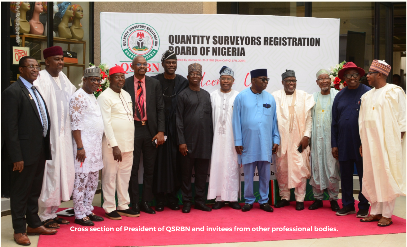
Cross section of President of QSRBN and invitees from other professional bodies.