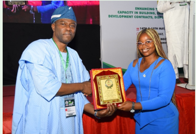
Presentation of award plaque to VACC Technical by the President of QSRBN. QSRBN Bronze sponsor