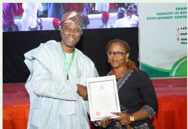
Presentation of Registration Certificate to an Inductee