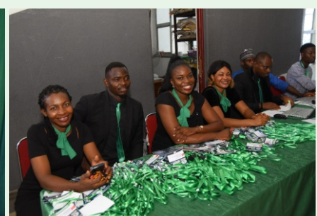
Photograph of Ushers