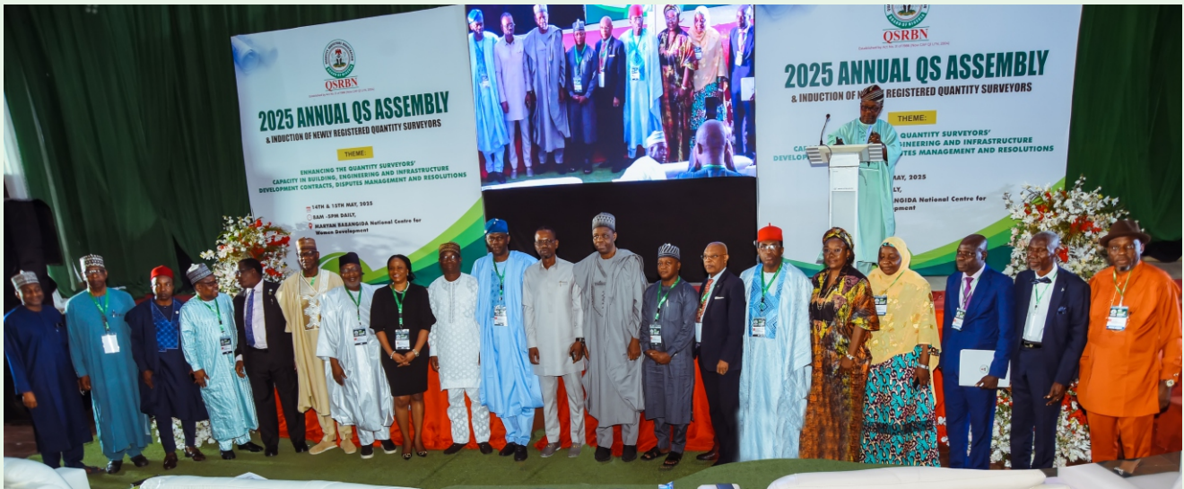
Group Photograph with the representative of the Hon. Minister, President of the QSRBN, Board members and Invitees

The 2025 Annual QS Assembly and Induction Ceremony organized by the Quantity Surveyors Registration Board of Nigeria (QSRBN) was convened on the 14 th and 15 th of May, 2025 at the Maryam Babangida Auditorium, National Centre for Women Development Abuja. The event, which brought together professionals and stakeholders across various sectors, was held under the theme: 'Enhancing the Quantity Surveyors' Capacity in Building, Engineering and Infrastructure Development Contracts, Disputes