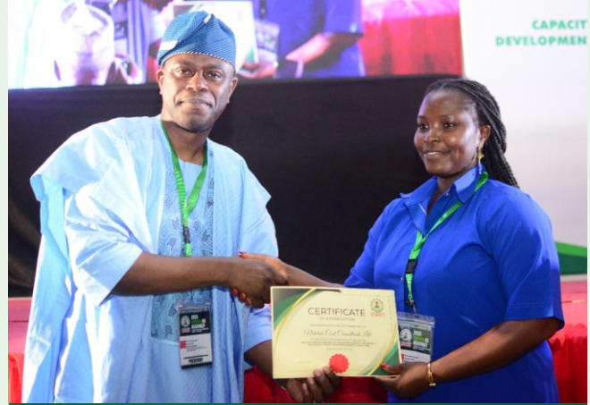
Presentation of award plaque to Natelak Cost Consultants Ltd. QSRBN sponsor